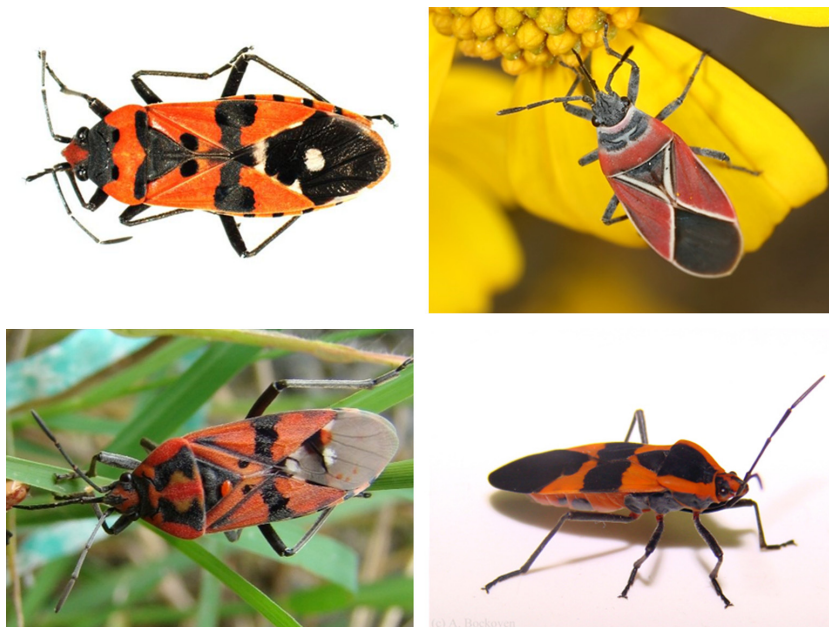
Figure 3. Four extensively studied species of Lygaeidae. Top right Neocoryphus bicrucis (photo courtesy of Jillian Cowles), bottom right Oncopeltus fasciatus (photo courtesy of Alison Bockoven), bottom left Spilostethus pandurus (David Shuker) and top left Lygaeus equestris (Liam Dougherty).