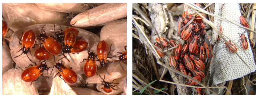
Figure 4. Right – Laboratory raised second instar nymphs of the species Spilostethus pandurus showing characteristic black and red coloration. Left – an aggregation of late-instar Lygaeus creticus nymphs and adults. Sicily.

Oncopeltus genus have been observed in aggregations containing both adults and nymphs (Root and Chaplin 1976). We will also discuss aggregation in the Lygaeidae further below when we consider the importance of pheromones. While groups are often considered to comprise kin, the extent of nonkin aggregations has yet to be investigated. As mentioned above, in some temperate species adults also aggregate for hibernation. This has been most extensively studied in the species Lygaeus equestris where hibernating adults typically enter reproductive diapause before aggregating at overwintering sites.