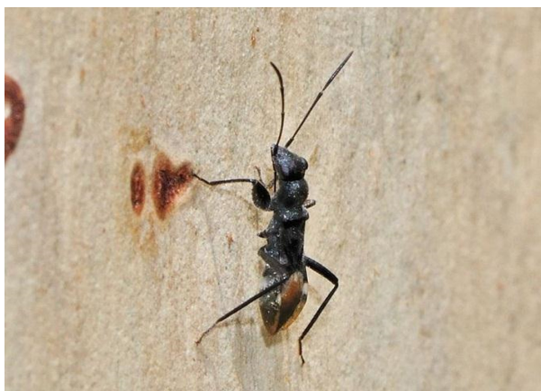
Figure 5. An ant-mimicking Seed Bug - Daerlac nigricans – form the Family Rhyparochromidae.

In terms of interspecific interactions, one particularly fascinating interaction concerns ant mimicry or “myrmecomorphy” (McIver and Stonedahl 1993), which is widespread in the Lygaeoidea and appears to have evolved multiple times (Schuh and Slater 1995). This mimicry is thought to act as an anti-predator defence as many predators avoid ants (Durkee et al. 2011) and may be morphological (Fig. 5) or behavioral in nature. For example, Neopamera bilobata , a Neotropical lygaeid, moves with jerky, ant-like movements when disturbed. This has been described as “action mimicry” and is thought to cause predators to hesitate in their attack, allowing the bugs