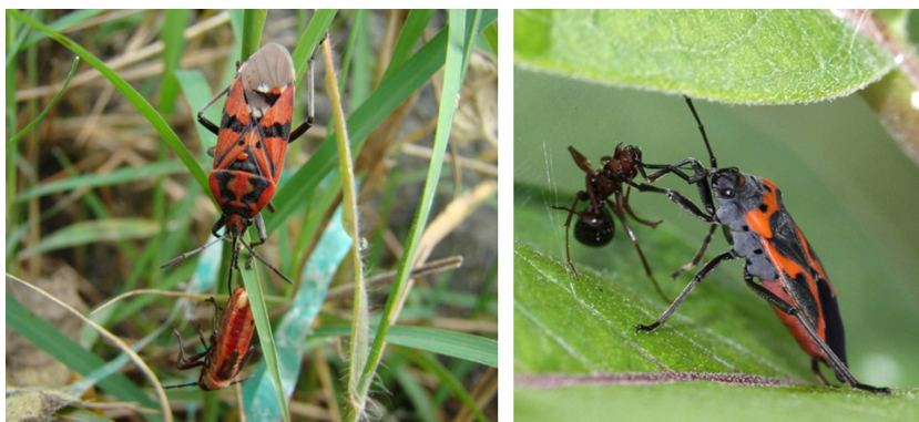
Figure 2. Left - An adult Spilostethus pandurus feeding on a Lygaeus creticus nymph. Sicily. Right - A Lygaeus kalmii feeding on an ant.

Third, four species of Nysius ( Nysius plebeius , N. expressus , and two species not identified to species level) have been found to harbor the primary gamma-protobacterial endosymbiont Schneideria nysicola in a pair of bacteriome structures (Matsuura et al. 2012). These authors also identified Wolbachia and a novel alpha-proteobacterium in these species, finding the latter in five other species